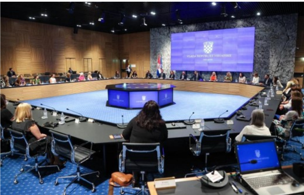
MEETING WITH CROATIAN PRIME MINISTER ANDREJ PLENKOVIC AND CROATIAN MINISTERS