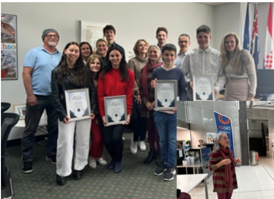
Bio21 Science Facility