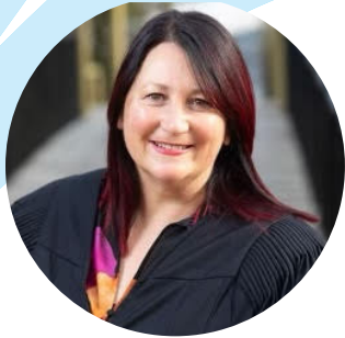
Maria Pecotic (NZ) Judge District Court New Zealand